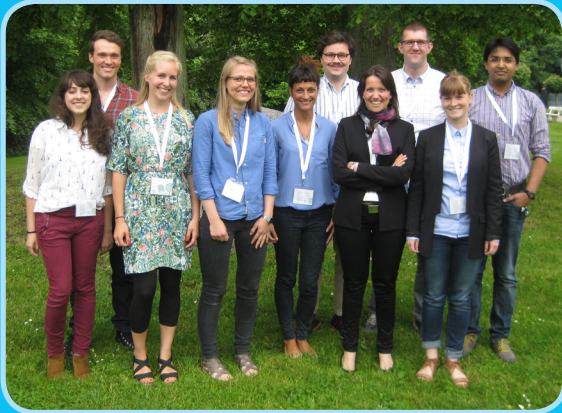
YWPDK Country Chapter Steering Committee

Young Water Professionals Denmark (YWPDK) is a newly started network for everyone under the age of 35 working or studying within the Danish water sector. YWPDK is an independent subcommittee under the International Water Association (IWA).